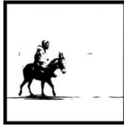
Jesus proceeded on his journey up to Jerusalem. Luke 19:28