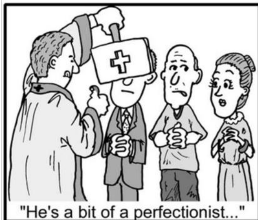
"He's a bit of a perfectionist..."