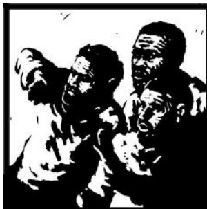
Jesus took Peter, James, and John and led them up a high mountain apart by themselves. Mark 9:2