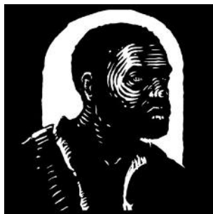
His disciples asked him, "Rabbi, who sinned, this man or his parents, that he was born blind?" John 9:2

SUNDAY, MARCH 29, 2020 FIFTH SUNDAY OF LENT