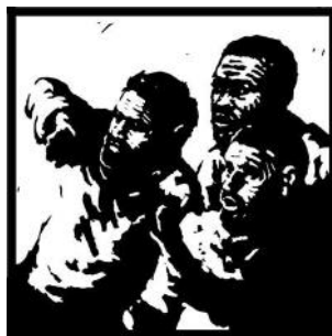
Jesus took Peter, James, and John and led them up a high mountain apart by themselves. Mark 9:2