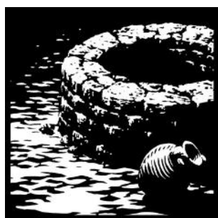
A woman of Samaria came to draw water.