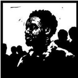
"Isn't this the son of Joseph?" Luke 4:22

Collection .....$1,171.04 ($77.00 auto-giving) Catholic Messenger .....$58.00