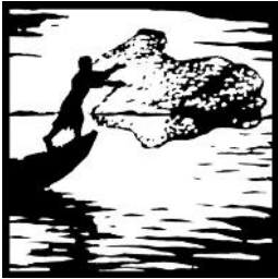
"Master, we have worked hard all night and have caught nothing, but at your command I will lower the nets." Luke 5:5