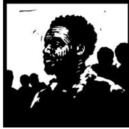
"Isn't this the son of Joseph?" Luke 4:22