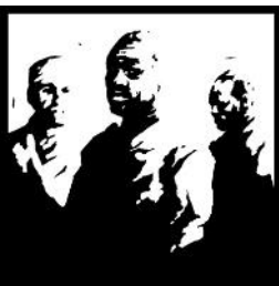
"Jesus took Peter, John, and James and went up the mountain to pray. Luke 9:28