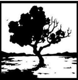
"Sir, leave it for this year also, and I shall cultivate the ground around it and fertilize it; it may bear fruit in the future." Luke 13:8-9