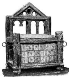
Chair of St. Peter

While the Solemnity of Sts. Peter and Paul, celebrated on June 29, focuses on the martyrdom of St. Peter, this celebration draws attention to his role in the Church. The "Chair of St. Peter" is an image of his seat of authority—an authority that was given not for his own personal gain but so that he could be a source of unity for the Church. Jesus told Peter, "I have prayed that your own faith may not fail; and once you have turned back, you must strengthen your brothers" (Lk 22:32). Today, this feast reminds us of the significance of the ministry of St. Peter and the succession of popes who followed in his footsteps. Copyright © 2016, Catholic News Service—United States Conference of Catholic Bishops, Washington, DC. All rights reserved. Used with permission