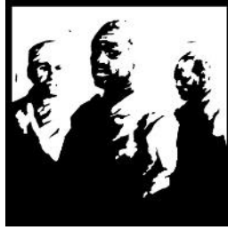
"Jesus took Peter, John, and James and went up the mountain to pray. Luke 9:28