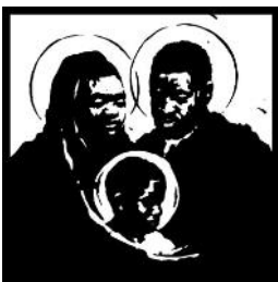
And Jesus advanced in wisdom and age and favor before God and man. Luke 2:52