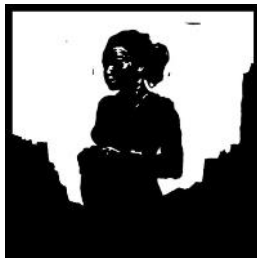
"Blessed are you who believed that what was spoken to you by the Lord would be fulfilled." Luke 1:45