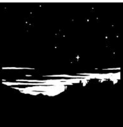
And behold, the star that they had seen at its rising preceded them, until it came and stopped over the place where the child was. Matthew 2:9