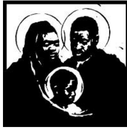
And Jesus advanced in wisdom and age and favor before God and man. Luke 2:52

Saints Basil the Great and Gregory Nazianzen, Bishops, Doctors of the Church